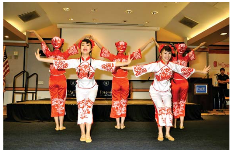
Beauty and precision were on display in the performances by the Dance Troupe of Nanjing Normal