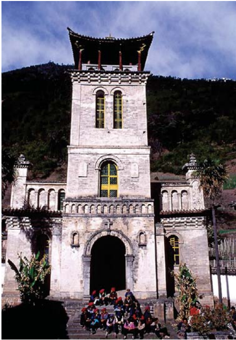
A Catholic Church in Yunnan, originally built by French missionaries.