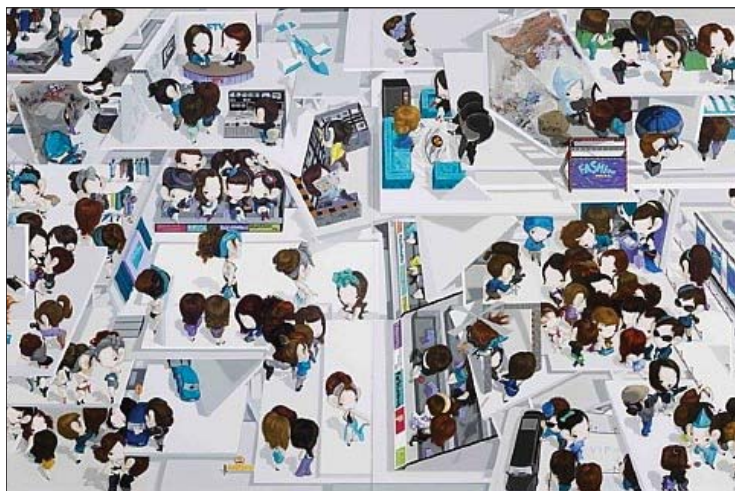
Fashion Ensemble , an oil painting on canvas by Contemporary Chinese Artist Han Yajuan. 2010.

Whatever dimension Chinese culture takes, whether it be gardening, contemporary art, or internet games, it always is a form of self-expression. We can only guess what guise it will take in the next era of Chinese history.