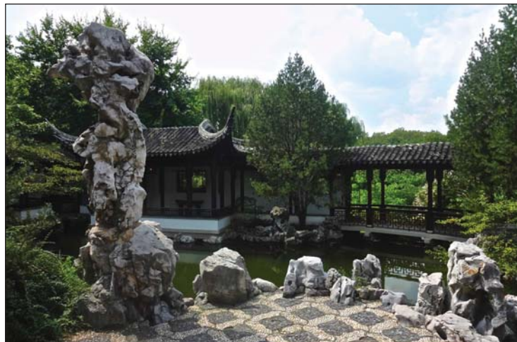
A view overlooking the koi pond within the New York Chinese Scholar's Garden in Staten Island.

On February 26th, the Pace CI delved into the history of one of the most classically esteemed of Chinese arts—garden landscaping, as Pace history professor Judith Whitbeck held a lecture entitled, "Chinese Gardens and Intellectual Pursuits." Professor Whitbeck believes that Chinese garden design is both an art form and an aesthetic pursuit. Chinese gardens, especially the classical private gardens of Suzhou, are a form of comprehensive art, demonstrating natural beauty and the aesthetics of the man-made landscape, all in the pursuit of "Heavenly" beauty. While Professor Whitbeck is mainly engaged in the intellectual history of the Ming and Qing Chinese dynasties but has a strong interest in classical Chinese gardens and in her in-depth research, including many trips to Suzhou and Ningbo and other places in China, she has amassed a large amount of visual materials. The pictures that Professor Whitbeck showed of the Tianyi Pavilion's Garden (the pavilion also holds the oldest private library in China), Humble Administrator's Garden and other classical gardens sparked great interest of the audience. Luckily, for us as New Yorkers there are examples of classical Chinese gardens in our backyard. The New York Chinese Scholar's Garden in Snug Harbor on Staten Island is a recreation of a compilation of Ming Dynasty gardens while at the Metropolitan Museum of Art, the Astor Court is based on the courtyard of the Garden of the Master of the Fishing Nets in Suzhou.