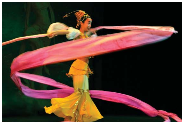
The Buddhist Inspired Dunhuang Dance, "Flying," was a colorful way to welcome in the New Year.

The performances opened in a creative way, with a short film chronicling a Chinese student living in New York, who is pulled by the "Golden Monkey" into the "live" performance at the Schimmel Theatre, segueing into the opening "Ode to Spring," a traditional fan dance complete with festive red costumes. After the opening dance, students from Pace University and partner institutions, and a number of independent artists, performed a variety of arts including dance, music, martial arts, and acrobatics, garnering cheers and applause from