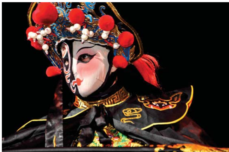
The acrobatics and elaborate costumes of "Face Shifting" were guaranteed to make it an automatic show stopper!

Some of the highlights of the afternoon including a rousing "Face Shifting" performance, the Buddhist inspired Dunhuang dance