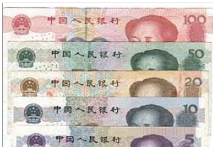
Renminbi banknotes from 2005 featuring the likeness of Mao Zedong